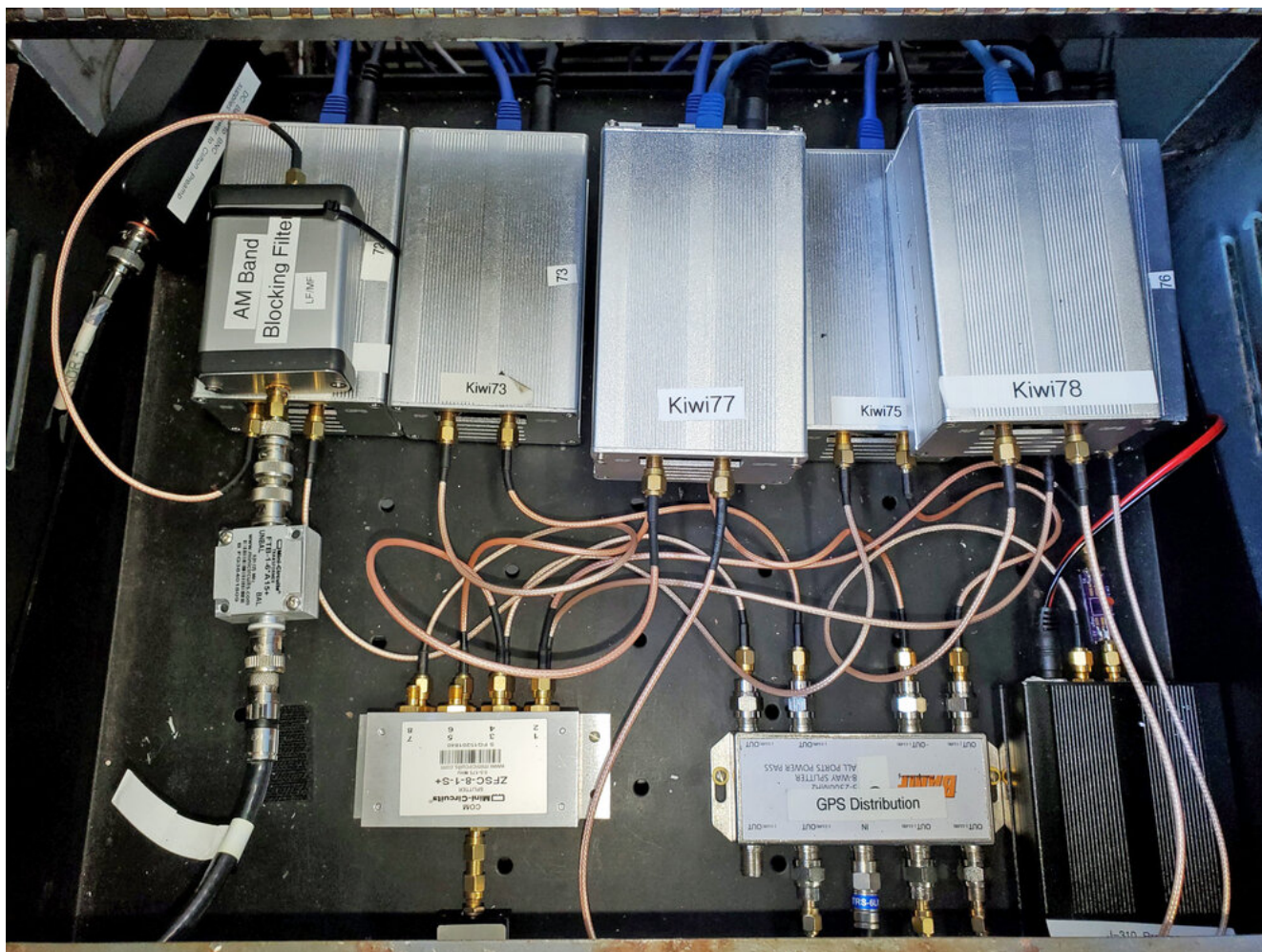
Seven Kiwi receivers and auxiliary equipment at the KPH receive site

The receive site at Point Reyes was selected by none other than Dr. Harold Beverage. He was looking for a location at the edge of the ocean with plenty of flat land for antennas and a very low electrical noise level for point to point HF reception. The site that became known as RS on the order wire fit the bill. The station began service in 1930. Coast station KPH moved to the site in 1946.